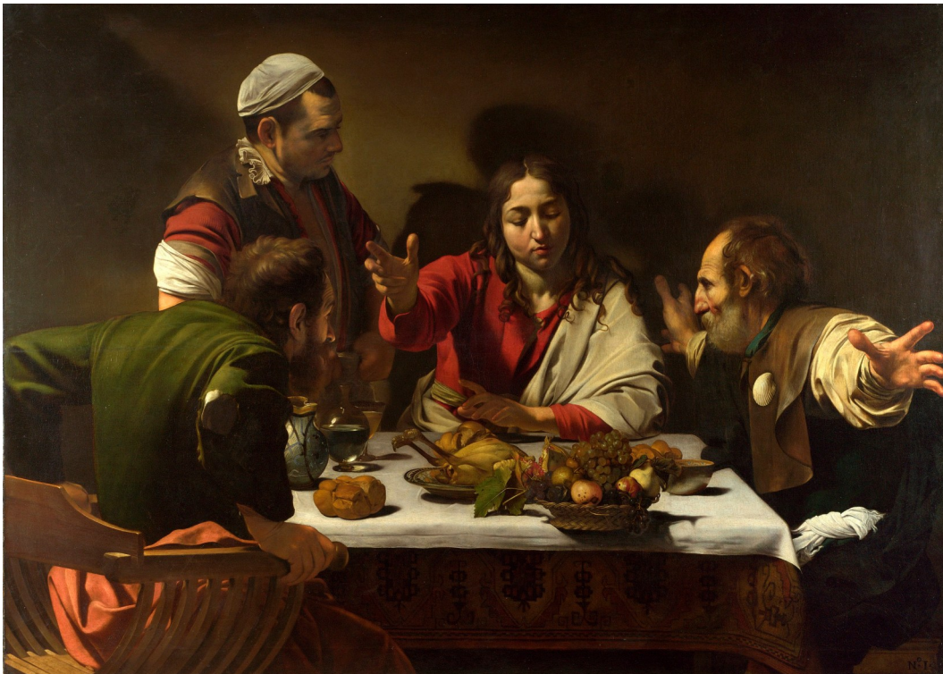
The Supper at Emmaus Caravaggio (1602-1603)